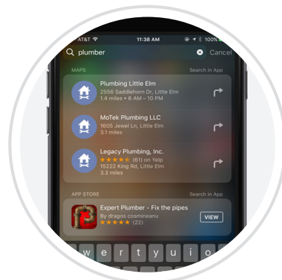
Voice Mobile Search